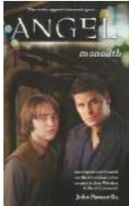
Angel: MONOLITH Simon Spotlight ISBN 0-689-87022-1 $6.99 The two in opposition must agree...

ANGEL: MONOLITH SYNOPSIS: Angel Investigations is up against a powerful figure who is on the eve of summoning a demonic equinox that would unleash unrivaled terror in Tinsel Town. It begins with the strange appearance of an ancient stone monolith in the middle of Hollywood Boulevard...