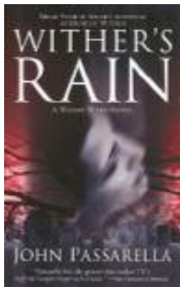
WITHER'S RAIN Pocket Star Books ISBN 0-671-02482-5 $6.99 Don't trust what you know.